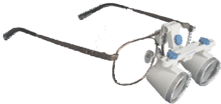
SLE Binocular Loupes (with Titanium frame)