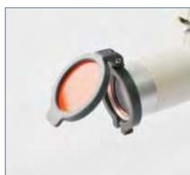
Yellow Filter (Optional)

Order code of 550-0010 set consisting of HL8000 with headband, a 4600mAh battery pack and a 122 switch mode power adapter, sterilizable covers, carrying case.