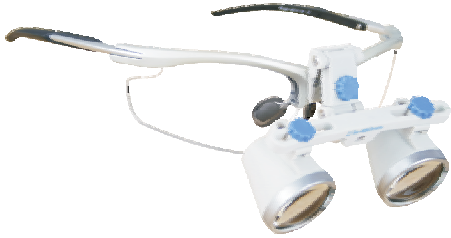
SLF Binocular Loupes (with sport frame)