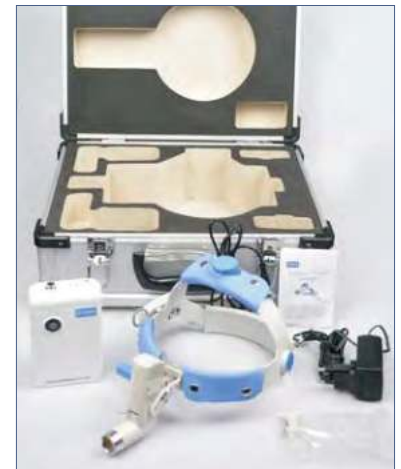
Order Code: 550-0010

Order code of 550-0010 set consisting of HL8000 with headband, a 4600mAh battery pack and a 122 switch mode power adapter, sterilizable covers, carrying case.