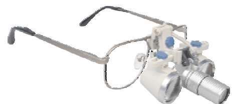
HL8300 Headlight combined with SLE Binocular Loupes