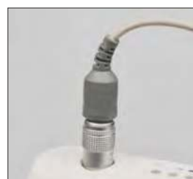
4 pin connector