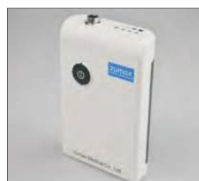
4600 mAh Battery Pack