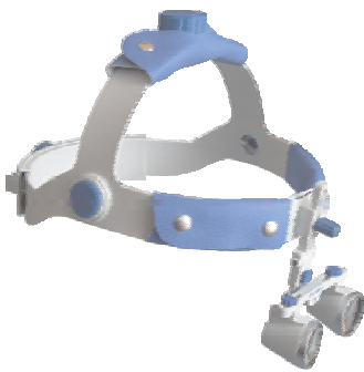
SLH Binocular Loupes (with headband)