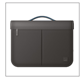
37304 Travel bag