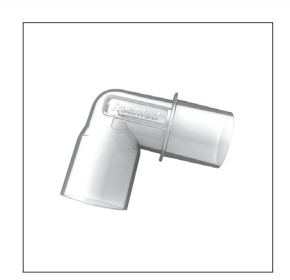
37394 Air10 tubing elbow (in-line elbow for use with non-heated tubing)