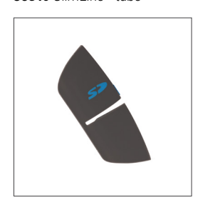
Side panel rubber SD card door 19728 Charcoal