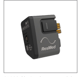
37302 Air10 oximetry module 22374 Xpod® oximeter 22371 Xpod clip 707560 Reusable soft sensor (medium) − 3-meter cable 370004 Air10 Oximetry Complete Kit: Includes oximetry module, Xpod, Xpod clip, reusable soft sensor (medium)