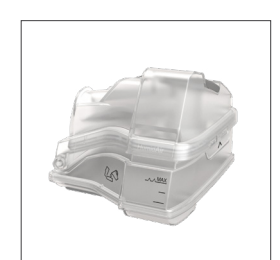
HumidAir heated humidifier 37300 Cleanable tub 37299 Standard tub