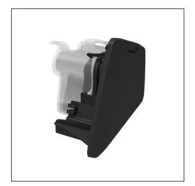
Air10™ side cover 37303 Charcoal