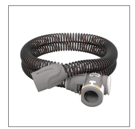
37296 ClimateLineAir heated tube 37357 ClimateLineAir Oxy heated tube 36810 SlimLine™ tube