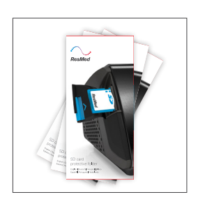
SD card protective folder 37329 with card (10 pk) 37330 without card (10 pk) 36931 SD card reader