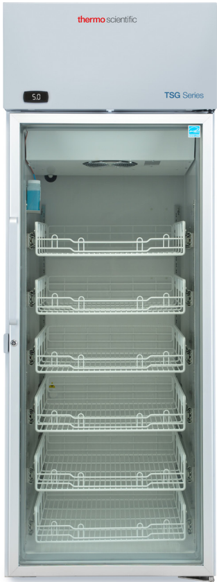
Thermo Scientific™ TSG2305P Refrigerator