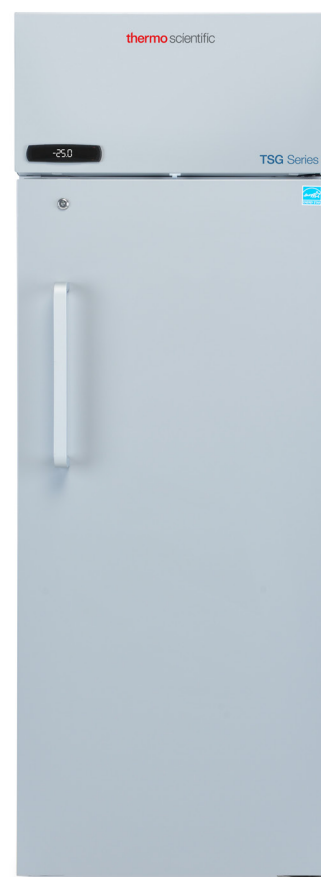
Thermo Scientific™ TSG2325FA Freezer