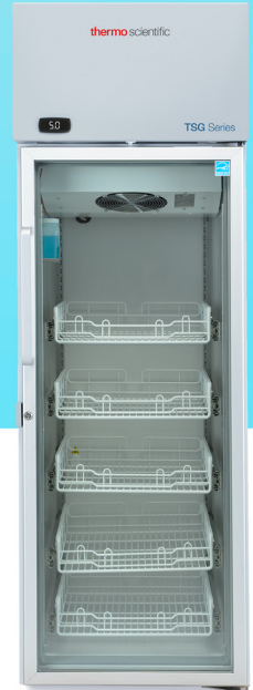
Thermo Scientific™ TSG1205P Refrigerator