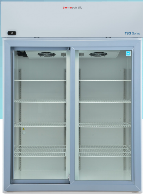
Thermo Scientific™ TSG4505G Refrigerator