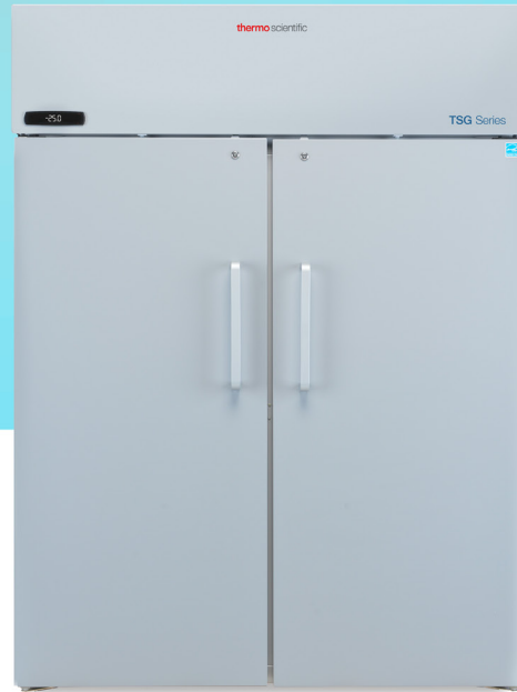
Thermo Scientific™ TSG5025F Freezer