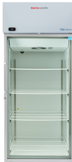
Thermo Scientific™ TSG3005G Refrigerator