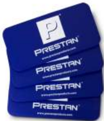
Kneeling Pads PP-KPAD-4 (4-pack) PP-KPAD-24 (24-pack)

PRESTAN Kneeling Pads provide cushioned knee and back comfort for students during CPR training classes.