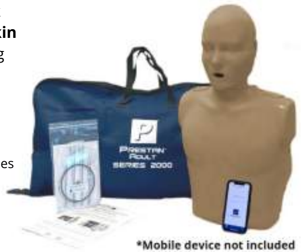
*Mobile device not included

The Professional Adult Series 2000 Lung Bags use the same easy to install PRESTAN design with the addition of a breath sensor. The Series 2000 lung bags are required for ventilation feedback via the PRESTAN CPR Feedback app.