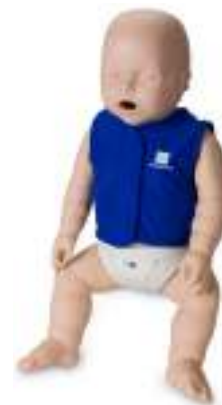
CPR Training Shirt Infant Manikin PP-ISHIRT-4 (4-pack)

PRESTAN Kneeling Pads provide cushioned knee and back comfort for students during CPR training classes.