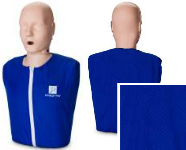
CPR Training Shirt Adult/Child/Ultralite Manikin PP-ACSHIRT-4 (4-pack)