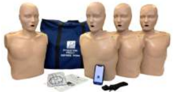
*Mobile device not included

PP-VALB-10 (10-pack) PP-VALB-50 (50-pack)