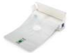
Generic CPR Practice Face Shields